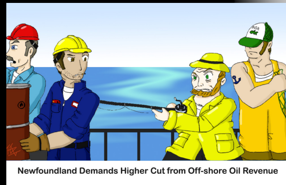
Newfoundland Demands Higher Cut from Off-shore Oil Revenue