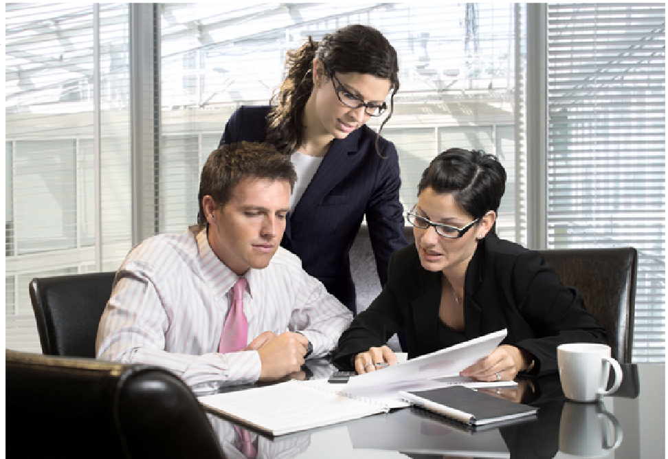
Continued changes in the buffers around Alberta may affect current applications

The EUB is currently completing a well spacing revision for the remainder of the province, subsequent to the Fall 2006 well spacing initiative (Schedule 13A). The following buffers and well densities are now applicable for holding applications in the remaining portion of Area 2 (outside Schedule 13A) plus all of Area 1.